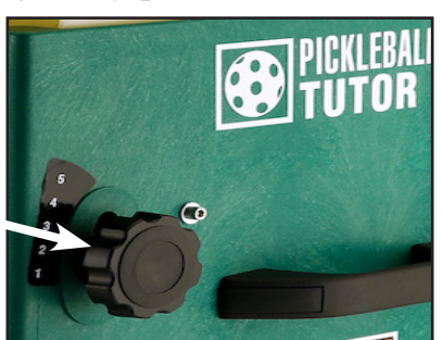
Elevation Indicator Electronic Elevation