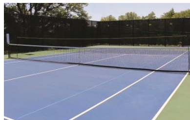
At lower height, using 2-section height.

Use the yellow bungee to create a line above the tennis net that can be hit over or under, depending on the desired exercise or drill. NOTE: The Travel Airzone can be used at two optional heights by connecting all 3 pole sections for the highest position OR folding one over as shown for a lower height visual guide.