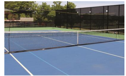
At 3-section upper height; bungee knotted to shorten length to singles court.